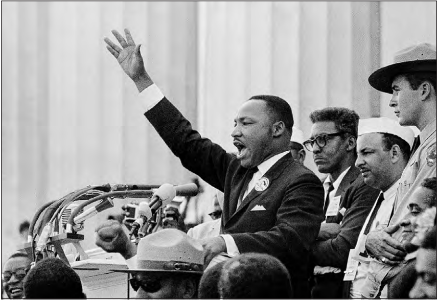
Rev. Dr. Martin Luther King, Jr., giving his “I Have a Dream” speech, August 28, 1963, at the March on Washington for Jobs and Freedom.

The Gwynn Oak campaign spanned an important period in civil rights history—from 1955 to 1963—beginning a few months before Dr. King made his first appearance on the protest scene and ending the same summer as his monumental March on Washington.